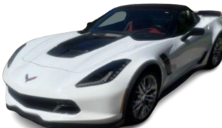
2019 Arctic White Z06 3LZ Auto Conv.