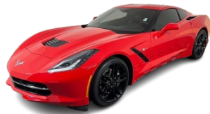
2019 Torch Red 1LT Manual Coupe