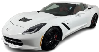
2016 Arctic White 2LT Auto Coupe