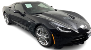
2018 Black 1LT Manual Coupe