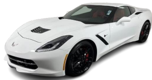
2023 White Pearl 3LT Coupe