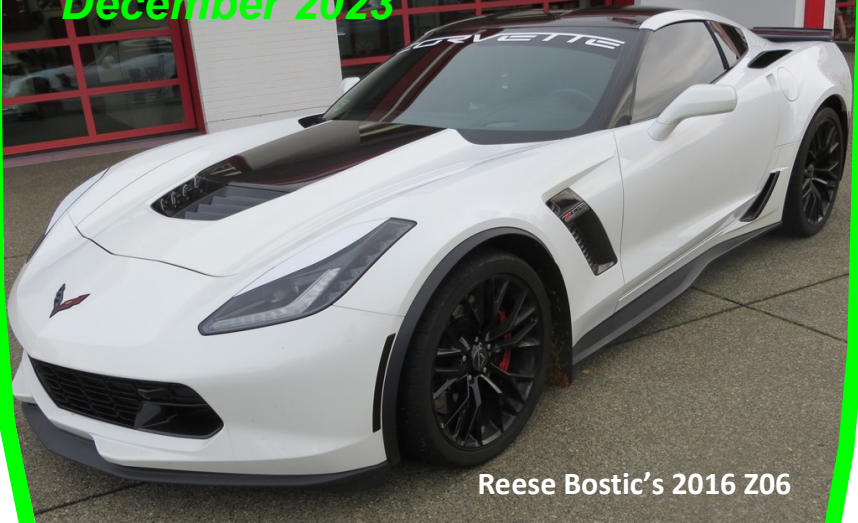
Reese Bostic's 2016 Z06