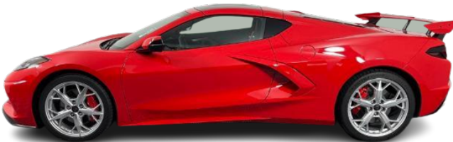
Pre-Owned 2022 Torch Red Coupe