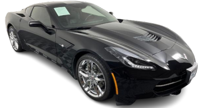
2018 Black 1LT Manual Coupe