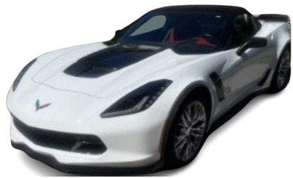
Pre-Owned 2019 Arctic White Z06 3LZ Auto