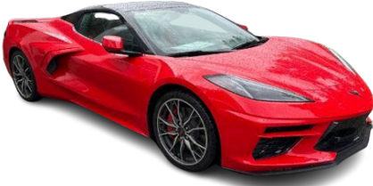
New 2023 Torch Red 3LT