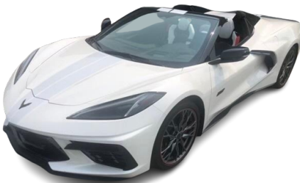
Pre-Owned 2023 White Pearl Tricoat HTC