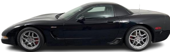
2003 Black Z06 Manual Coupe

EVERGREEN RAD CUSTOM RIDES: (425) 677-8284 • Kyle Rowe https://radcustomrides.com