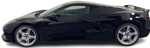
2020 Black Coupe

1601 18th Ave NW, Issaquah, WA 98027 Evergreen Chevrolet • Service Monday-Friday • 8 am-5 pm) (425) 651-6613 Pre-owned Corvettes