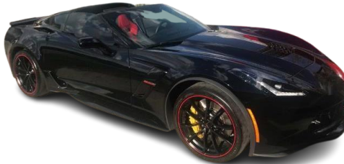
2017 Black GS Manual