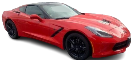
2017 Torch Red Auto Coupe