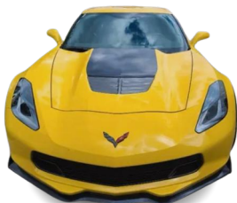
2015 Velocity Yellow Z06 Manual Coupe