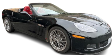
2013 Black GS Auto Convertible