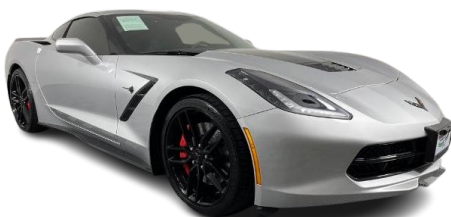
2019 Blade Silver Z51 1LT Auto Coupe

EVERGREEN RAD CUSTOM RIDES: (425) 677-8284 • Kyle Rowe