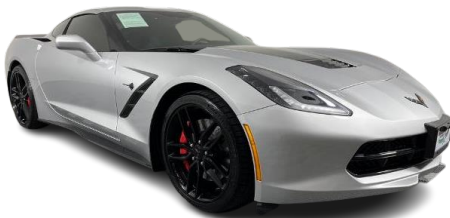
2019 Blade Silver Z51 1LT Auto Coupe

EVERGREEN RAD CUSTOM RIDES: (425) 677-8284 • Kyle Rowe https://radcustomrides.com