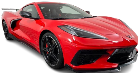
2020 Torch Red Coupe