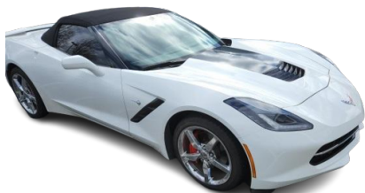
2014 Arctic White 1LT Auto Convertible