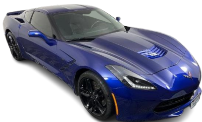
2017 Admiral Blue Z51 Coupe Auto