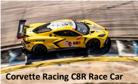
Corvette Racing C8R Race Car

driver a decade ago, racing at events including Sebring, Le Mans, and Petit Le Mans. Since then, his role has expanded exponentially, and Taylor joined the Corvette Racing team full time in 2020. On the flip side, and what some of his fans may not know, is that Taylor also portrays a more lighthearted, humorous alter ego version of himself which he channels with his ever-growing fan base by way of his social media channels.