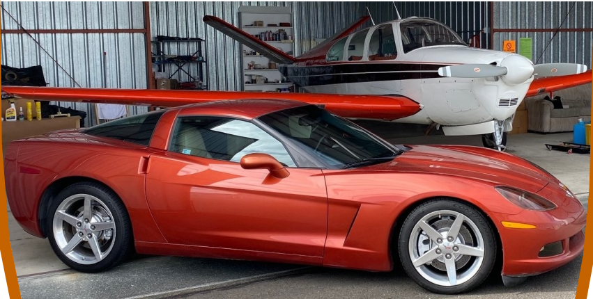
Sandy Allen's 2005 Daytona Orange Coupe