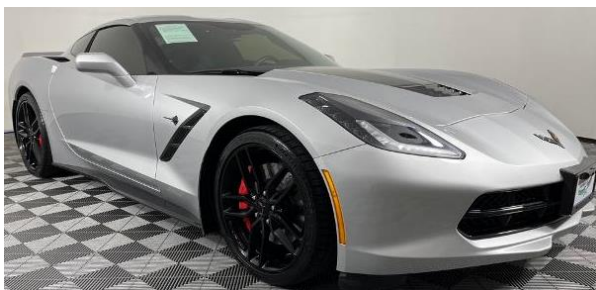
2019 Blade Silver Z51 Auto 1LT Coupe

EVERGREEN RAD CUSTOM RIDES: (425) 677-8284 • Kyle Rowe https://radcustomrides.com