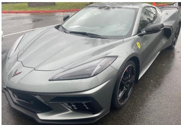
2023 Hypersonic Gray Coupe

EVERGREEN RAD CUSTOM RIDES: (425) 677-8284 • Kyle Rowe