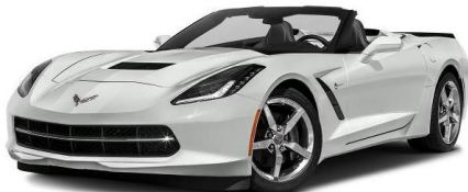
2017 Arctic White Auto Conv