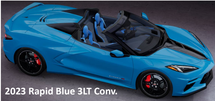
2023 Rapid Blue 3LT Conv.