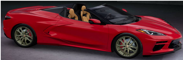
2023 Red Mist Metallic Z51 2LT Conv.