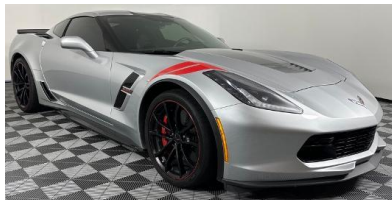
2017 Blade Silver GS 3LT Auto Coupe