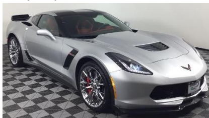
2015 Blade Silver Z06 Auto Coupe

EVERGREEN RAD CUSTOM RIDES: (425) 677-8284 • Kyle Rowe