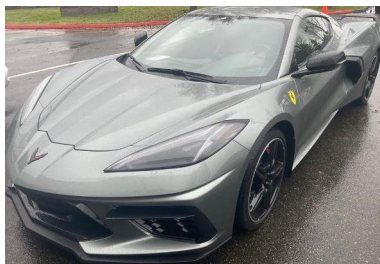
2023 Hypersonic Gray Coupe