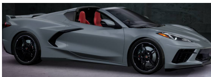
2023 Hypersonic Gray 1LT Coupe