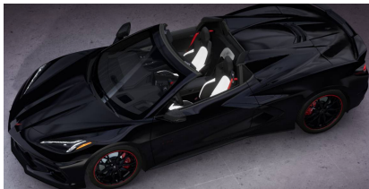
2023 Carbon Flash Metallic 3LT Conv. 70th Anniversary Special Edition