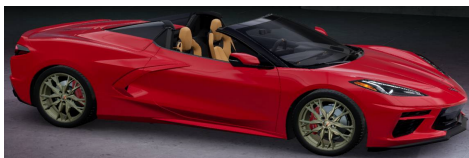
2023 Red Mist Metallic Z51 2LT Conv.