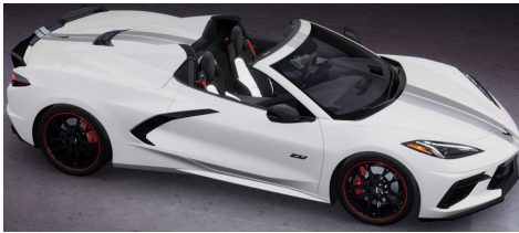
2023 White Pearl Metallic 3LT Conv. 70th Anniversary Special Edition