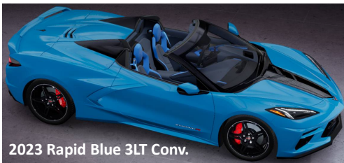
2023 Rapid Blue 3LT Conv.