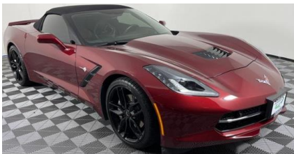
2016 Long Beach Red 2LT Auto Conv