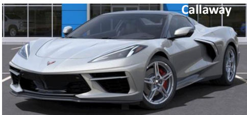
2022 Silver Flare Metallic 3LT Convertible LT2 Engine

https://www.evergreenchevrolet.com/VehicleSearchResults?searchQuery=corvette