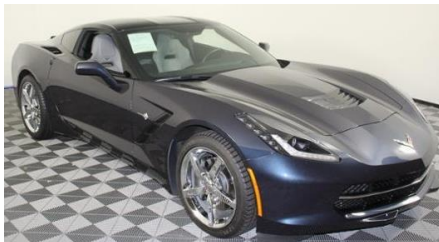
2015 Night Race Blue Auto GS 3LT Coupe