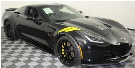
2019 Black Auto GS 3LT Coupe