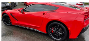
2016 Torch Red Z51 2LT Manual Coupe