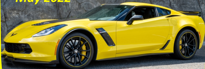
Carl & Lorene Davidson's 2016 Racing Yellow Z06-ZCR Coupe