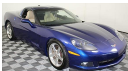
2005 Lemans Blue Manual Coupe