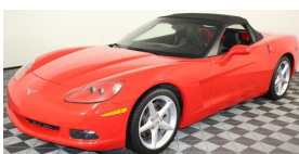
2012 Torch Red Auto Convertible