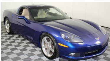
2005 Lemans Blue Manual Coupe