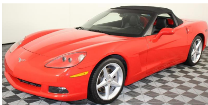
2012 Torch Red Auto Convertible