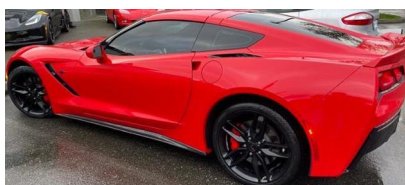
2016 Torch Red Z51 2LT Manual Coupe