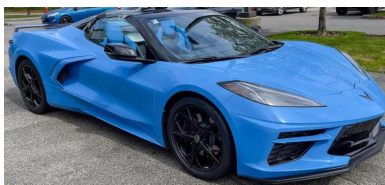
2022 Rapid Blue Z51 3LT Hardtop Convertible

https://www.evergreenchevrolet.com/VehicleSearchResults?searchQuery=corvette