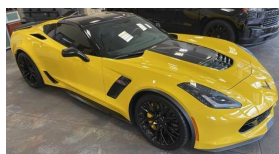
2018 Racing Yellow Z06 2LZ Auto Coupe