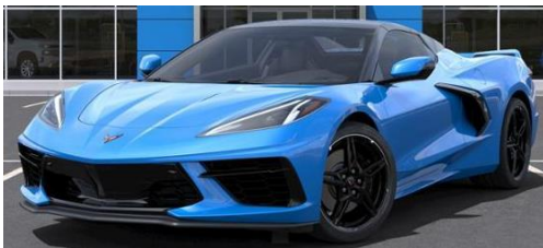
2022 Rapid Blue HTC