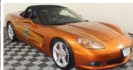
2007 Atomic Orange Z51 Pace Car Convertible