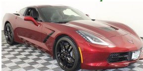
2018 Long Beach Red 1LT Manual Coupe