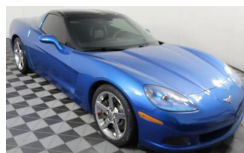
2008 Jetstream Blue 3LT Z51 Coupe