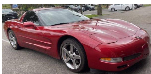
1999 Magnetic Red Manual Coupe