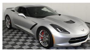
2016 Blade Silver Z51 3LT Manual Coupe