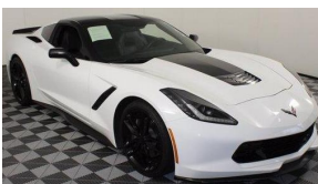
2015 Arctic White 1LT Manual Coupe