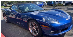
2006 Lemans Blue Z51 Auto Convertible