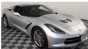
2014 Blade Silver 3LT Manual Coupe