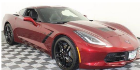
2018 Long Beach Red 1LT Manual Coupe