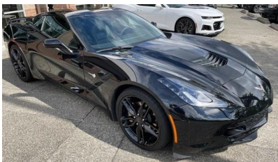
2019 Black Z51 2LT