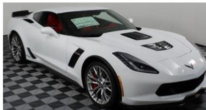
2019 White Z06 Callaway