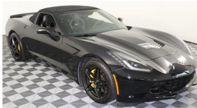
2014 Black 3LT Conv.