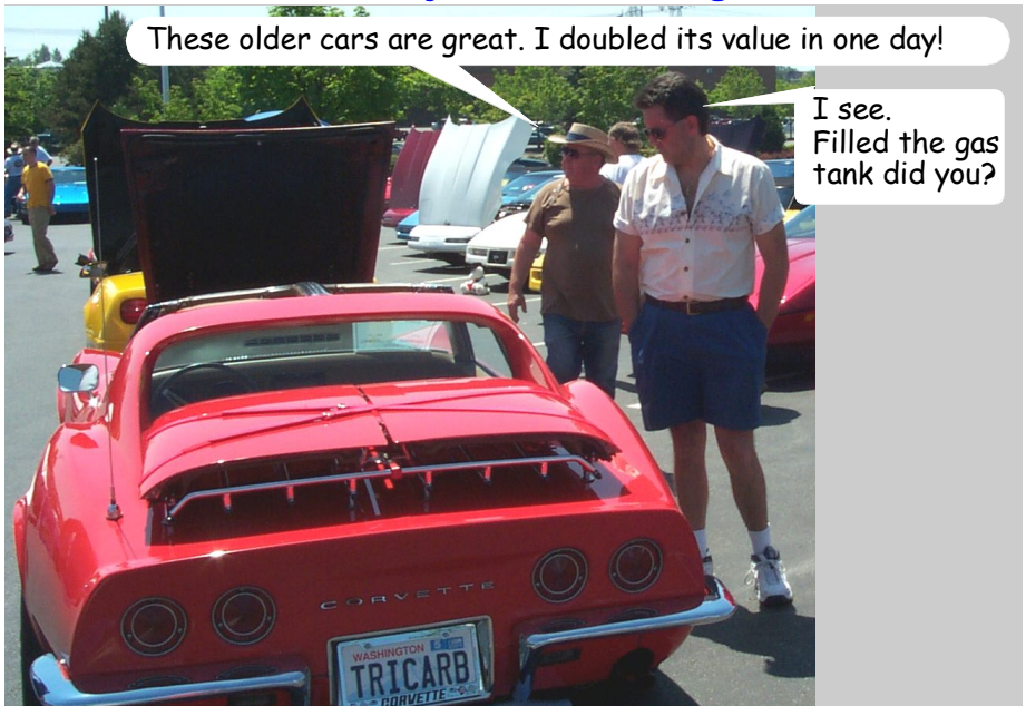
This first appeared in the April 2005 OYM