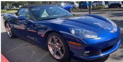
2006 Blue Z51 Conv.