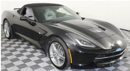
2016 Black 3LT Conv.