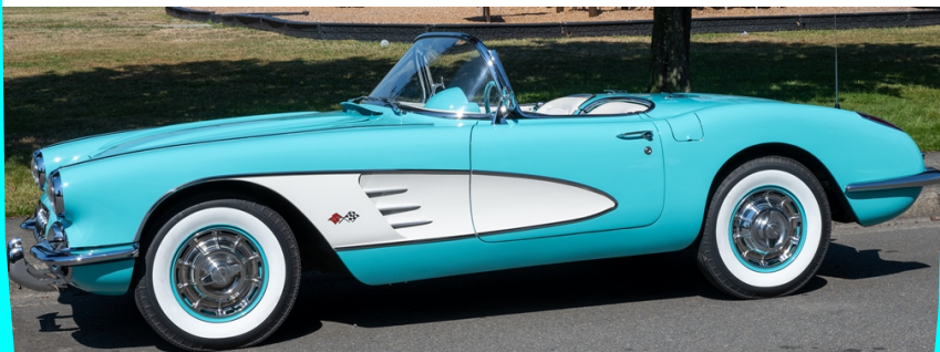
Ed Buchwald's 1960 Turquoise Roadster