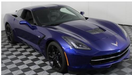
2019 Admiral Blue 1LT Manual Transmission

https://www.evergreenchevrolet.com/VehicleSearchResults?searchQuery=corvette