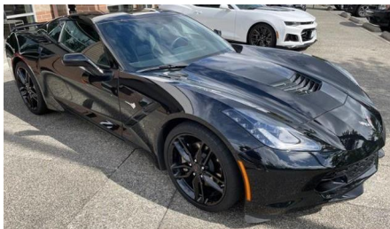
2019 Black Z51 2LT