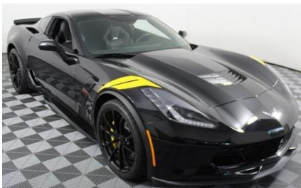
2019 Black GS 3LT