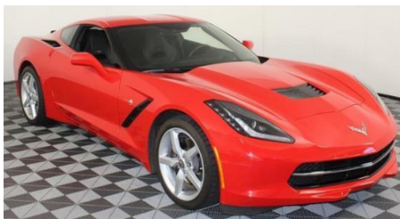
2015 Torch Red Z51 2LT