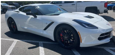
2015 Arctic White Z51 3LT