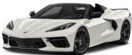
2021 Arctic White Z51 2LT Coupe with Spectra Gray 5-Spoke Wheels

Photos are representative, not the actual vehicles