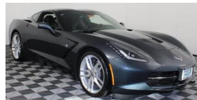
2019 Shadow Gray Manual 1LT Z51 style wheels

https://www.evergreenchevrolet.com/VehicleSearchResults?searchQuery=corvette 1601 18th Ave NW, Issaquah, WA 98027