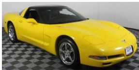
2003 Millennium Yellow Automatic