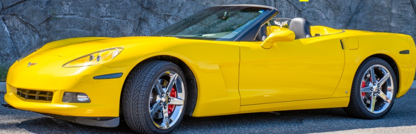
Marvin & Linda Scott's 2007 Velocity Yellow Convertible