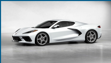
Arctic White COUPE 3LT Order # ZDVD2V