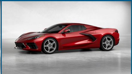
Red Mist CONVERTIBLE 3LT Order # ZKHHTQ