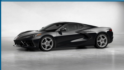
Black COUPE 1LT Order # ZKHHVK