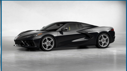
Black CONVERTIBLE 3LT Order # ZDVDRZ