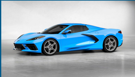
Rapid Blue CONVERTIBLE 2LT Order # ZJMDJ7

ALWAYS MORE ALWAYS FOR LESS! 2021 Corvettes Available for You with a March Delivery!