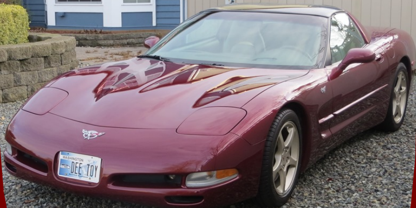
Dee Petersen's 2003 Anniversary Red Coupe