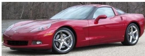
Crystal Red 3LT

https://www.evergreenchevrolet.com/VehicleSearchResults?searchQuery=corvette 1601 18th Ave NW, Issaquah, WA 98027