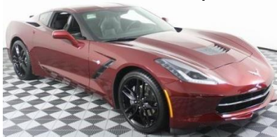
Long Beach Red 1LT