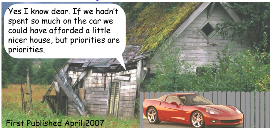
First Published April 2007