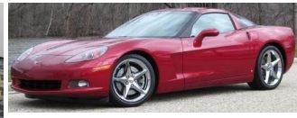
Crystal Red 3LT

https://www.evergreenchevrolet.com/VehicleSearchResults?searchQuery=corvette