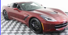
Long Beach Red 1LT