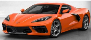
Sebring Orange 2LT