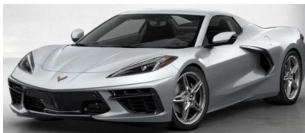
Blade Silver 2LT