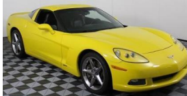
Velocity Yellow Auto