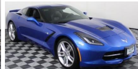
Laguna Blue Manual

https://www.evergreenchevrolet.com/VehicleSearchResults?searchQuery=corvette