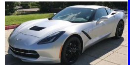
2019 Blade Silver Manual

https://www.evergreenchevrolet.com/VehicleSearchResults?searchQuery=corvette