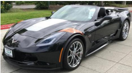
17 Black Grand Sport Z07-3LT