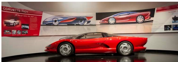
The Corvette Indy concept car on display as part of the new 'Vision Realized' exhibit.

Among the cars on display are the Corvette Indy, a C8, and the experimental two-rotor Corvette known as XP-987 GT, which was recently acquired by the Museum thanks to the fundraising efforts of Lone Star Corvette Club and Texas