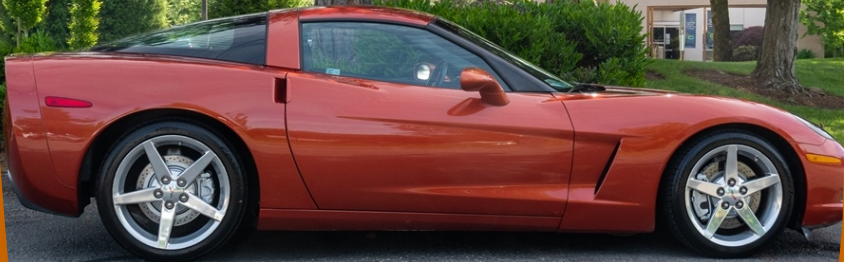
Sandy Allen's 2005 Daytona Sunset Orange Coupe