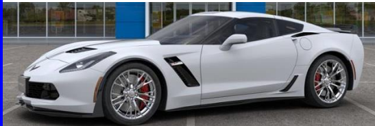
2019 Arctic White Callaway Z06 3LZ