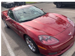
2006 Monterey Red Merrallic Z51 Coupe

For current cars and more details please visit: