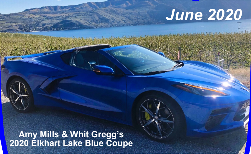
Amy Mills & Whit Gregg's 2020 Elkhart Lake Blue Coupe