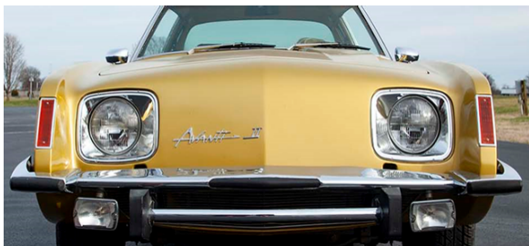
1977 Studebaker features Corvette engine and fiberglass body