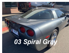
03 Spiral Gray

For current cars and more details please visit: