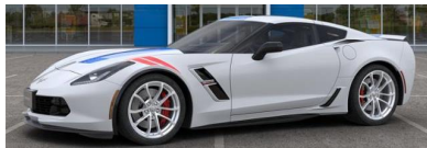
19 GS White 2LT Manual