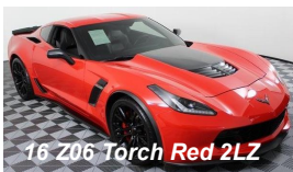
16 Z06 Torch Red 2LZ