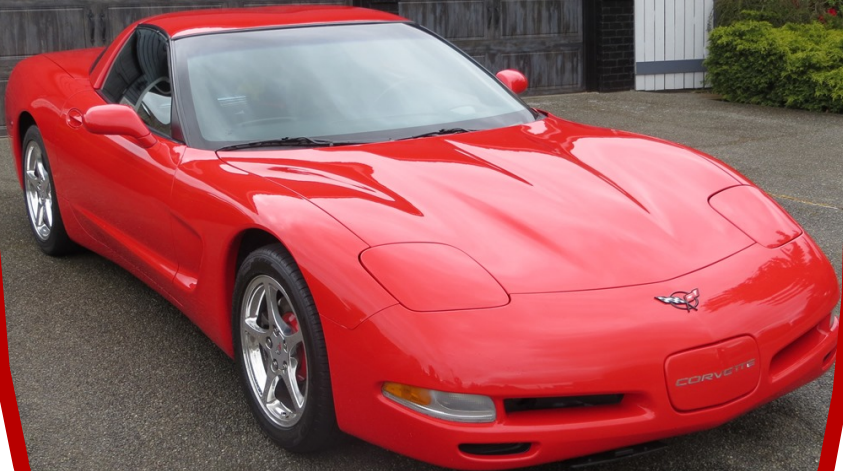
Chad & Diane Gudjonson's 2002 Torch Red Coupe