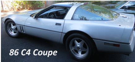
86 C4 Coupe

Forest is a “building engineer” by profession, and spends his time doing design, building and restoration of downtown Seattle skyscrapers.