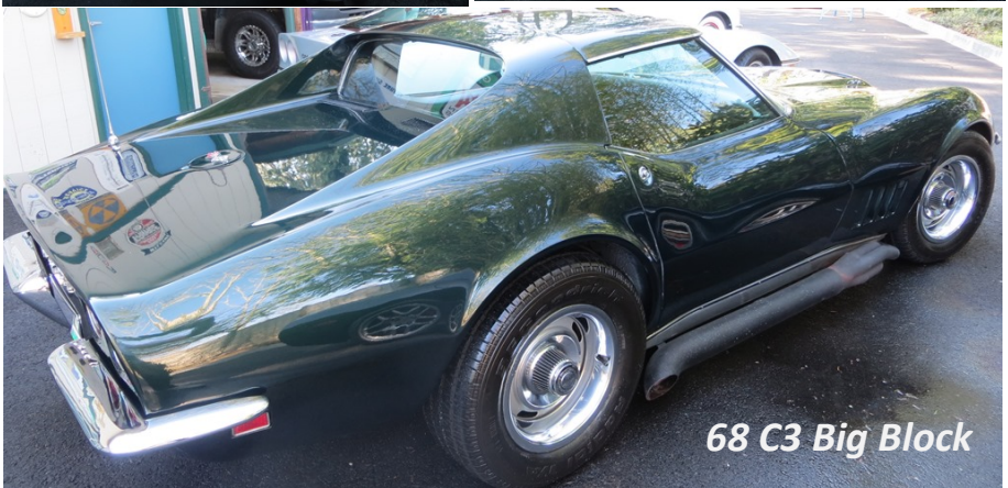
68 C3 Big Block

This Big Block C3 Mako has mean looking side pipes, and their “growl” backs that up big time. The British Green factory color is perfect for it.