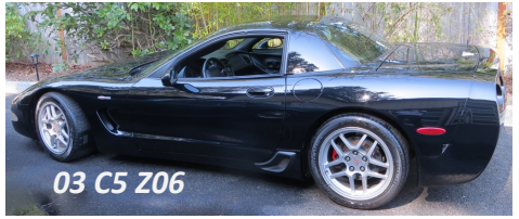
03 C5 Z06