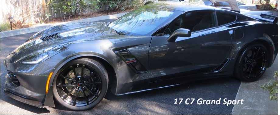
17 C7 Grand Sport