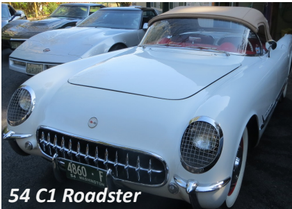
54 C1 Roadster