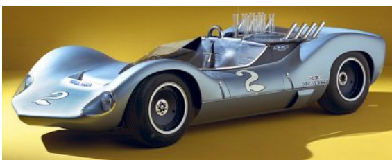
Details on the 196 Grand Sport IIB from Amelia island Concours

This will mark the first appearance of the one-off experimental 1964 GS IIB outside the Chaparral Gallery of the Petroleum Museum in Midland, Texas. Applying the name