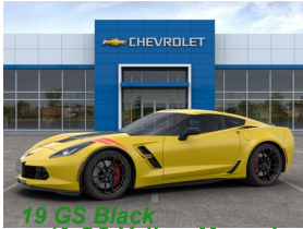
19 GS Black 19 GS Yellow Manual