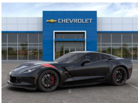
19 GS Black