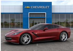
19 Long Beach Red