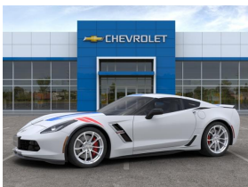
19 Callaway Z06