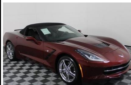
17 Long Beach Red Conv.

For current cars and details please visit: