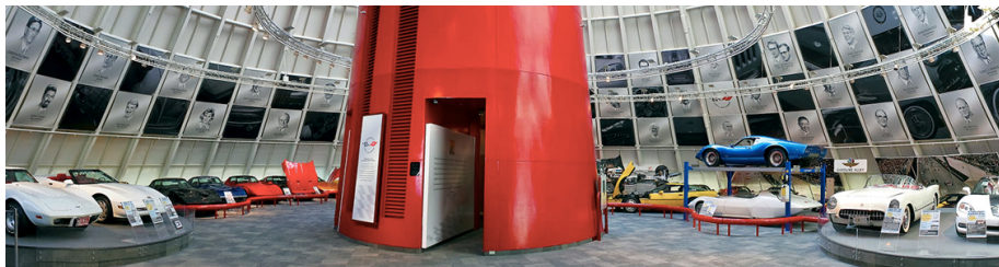
National Corvette Museum - Corvette Hall of Fame

https://www.corvettemuseum.org/learn/about-corvette/corvette-hall-of-fame/