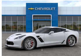
19 GS White Manual