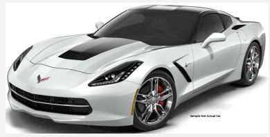
2019 Arctic White Coupe raffle 2/7/2019 $10 Unlimited Tickets

If you wonder who actually wins these Corvettes you can find out here: