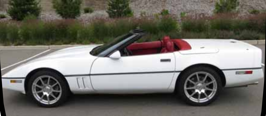
Mark Perez's 1990 Polar White Convertible