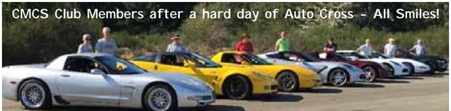
CMCS Club Members after a hard day of Auto Cross - All Smiles!