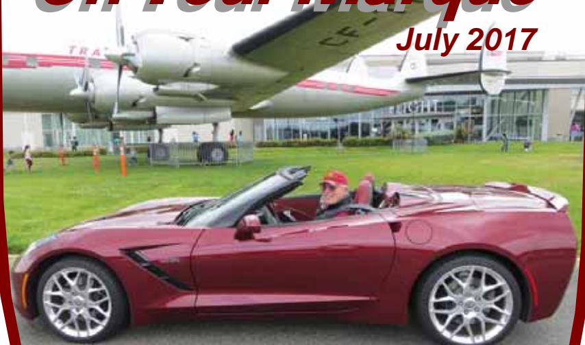
Ken Huebner's 2016 Long Beach Red Z51 Convertible