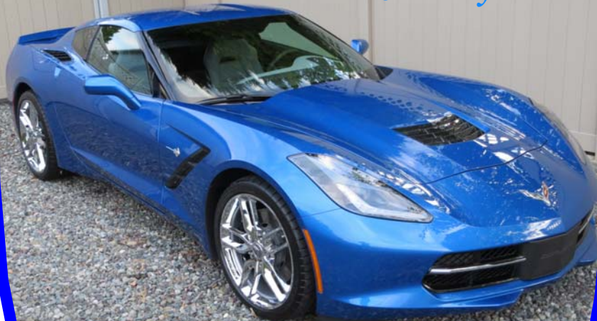
Oran & Dee Petersen's 2014 Laguna Blue Z51 Stingray