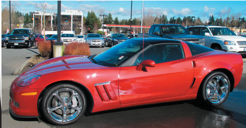
2013 Grand Sport available at Lee Johnson