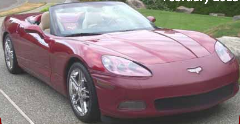
Craig & Candy Turi's 2006 Monterey Red Convertible