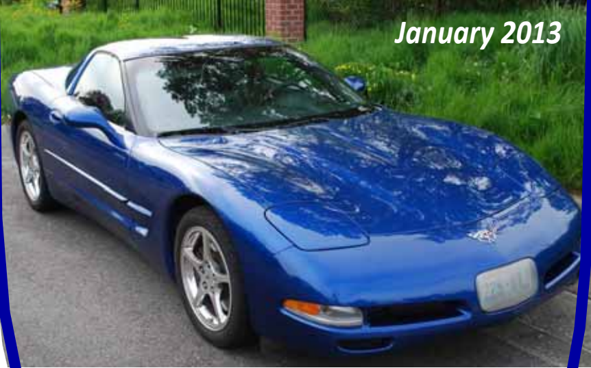
Oran & Dee Petersen's 2003 Electron Blue Coupe