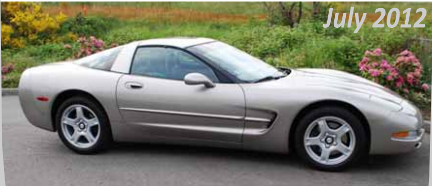
Chuck & Stacie Geyer's 1999 Light Pewter Coupe