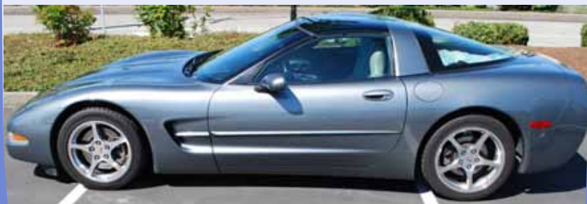
Butch & Carol Feveryear's 2004 Coupe