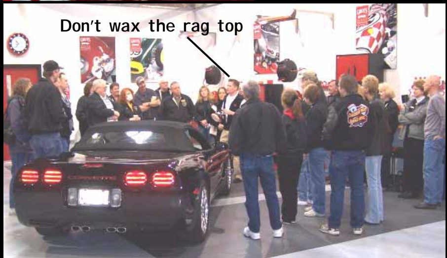
Don't wax the rag top