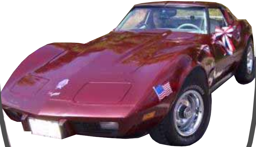
J'anette' Kerr's 1977 L82 Coupe