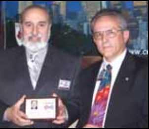
AI - Activities