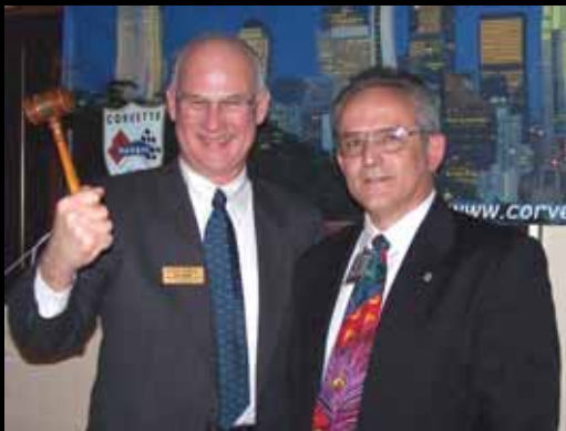
Passing of the Gavel