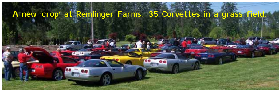
A new 'crop' at Remlinger Farms. 35 Corvettes in a grass field.