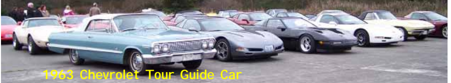
1963 Chevrolet Tour Guide Car

Wet Weekend Guided Tour Stop (Narrated using the Club Radios)