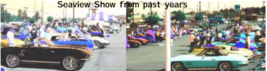
Seaview Show from past years

Corvettes must be registered & in place by 11 am for S & S Ballot box closes at 2 pm Trophies awarded at 2:30 pm Contacts: Han Song (Seaview) (425) 742-1920 Rick Milsow (CMCS) (425) 486-2309 rick.mi@verizon.net