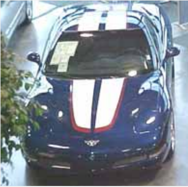
2004 Blue Z06 Commemorative Edition