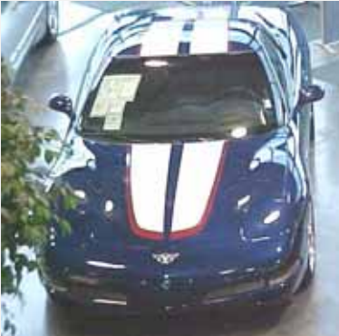
2004 Blue Z06 Commemorative Edition