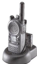
CLS1110 1 Watt

NOTE: These are UHF frequencies, not VHF